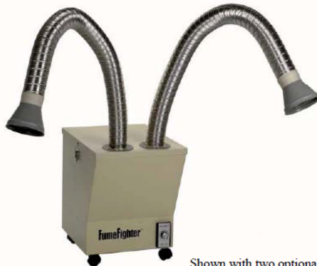
Shown with two optional arms