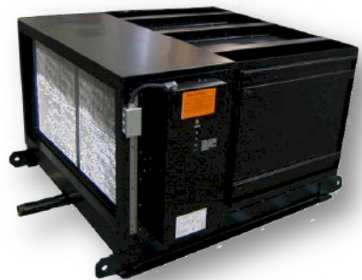
F72B SHOWN WITH 180 LBS OF CARBON MOUNTED ON A SKID