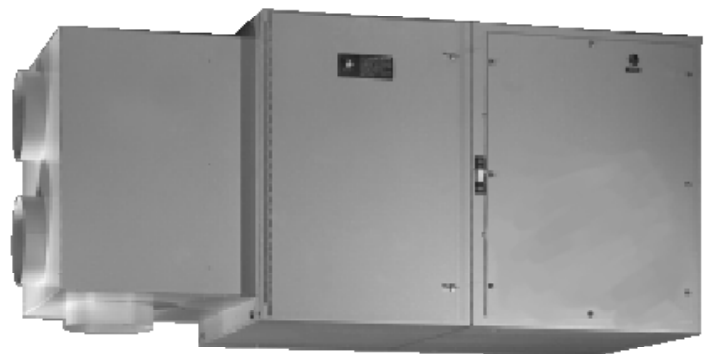
F66 shown with optional source capture plenum.