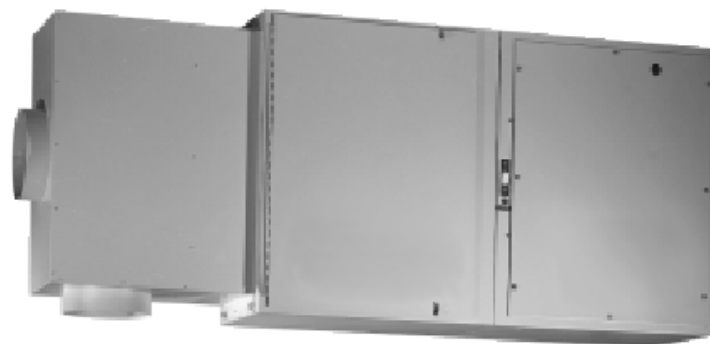
F33 shown with optional source capture plenum.