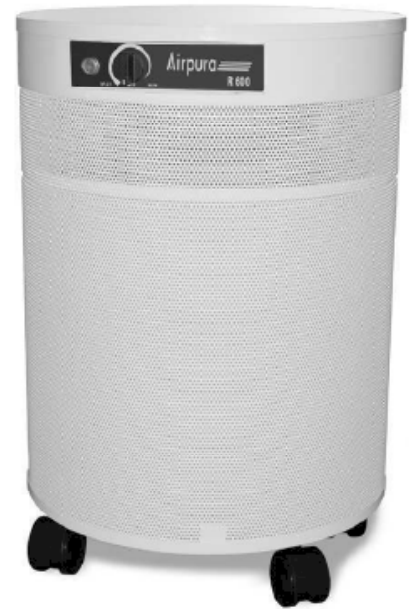
The Airpura C600

Toulene Naphthene Pesticides Chlorine Mold Mycotoxins